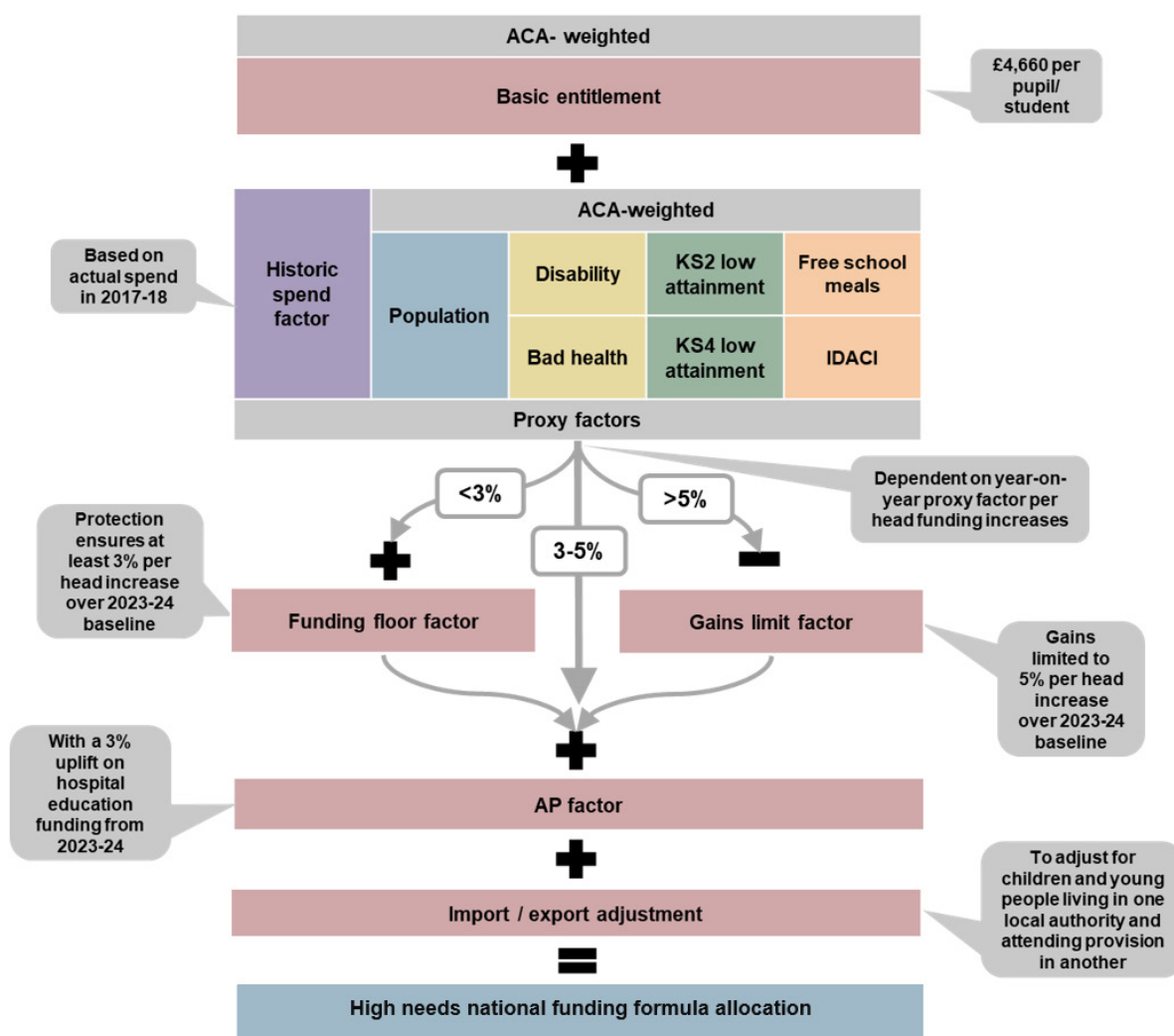
Figure 3: This illustrates the formula factors that are used to calculate high needs funding allocations through the NFF. The diagram shows the eleven factors which reflect the level of need in an area, as well as the funding floor and gains limit factors which ensure that all authorities receive an increase in funding of between 3% and 5% per head of their 2-18 population.

The basic entitlement factor and the historic spend factor are designed to reflect aspects of the local SEND system. The basic entitlement factor gives a set amount of funding (£4,660) per pupil based on the number of pupils in special schools (including those in independent special schools), performing the same role as its counterpart within the mainstream schools NFF. The historic spend factor provides every local authority with a set percentage (50%) of their 2017-18 spending on high needs to reflect past spending patterns, given the constraints that the local demand for and supply of provision will continue to place on future spending.