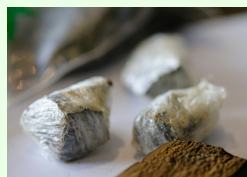
Cannabis resin/Hash - dark/brown black lump.