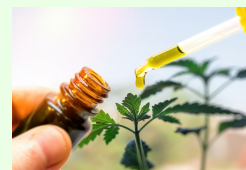
THC = illegal CBD = legal Cannabis oil - sticky, thick, yellowy/brown liquid