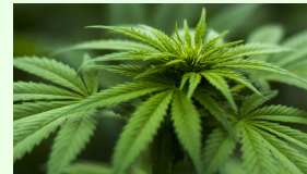
Cannabis plant the drug derives from.

You can read more about cannabis on the talktofrank website Cannabis | Weed | Effects of Cannabis | FRANK (talktofrank.com)