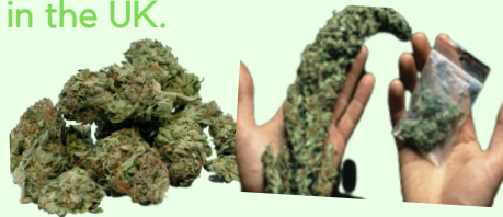
The left image shows dried and most likely imported cannabis, the right image shows fresher most likely UK grown cannabis.

Cannabis leaf/weed/marijuana - dried leaves and flowering part of the plant, it resembles dried herbs and is most common in the UK.